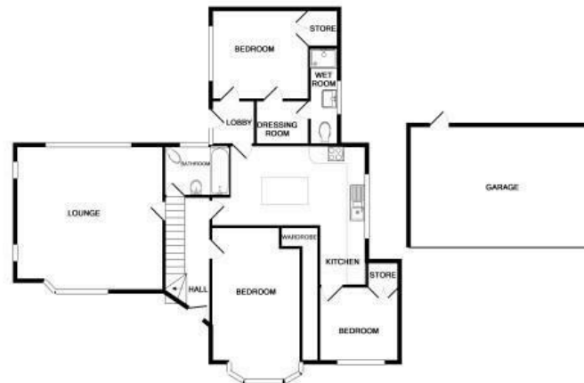
GROUND FLOOR APPROX FLOOR AREA 1311 SQ FT (122.3 SQ M)

TOTAL APPROX FLOOR AREA 2116 SQ FT (196.6 SQ M)